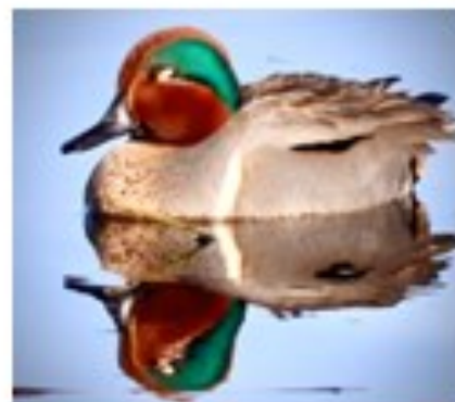
Green Winged Teal