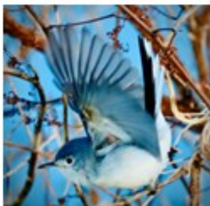
Blue -Gray Gnatcatcher