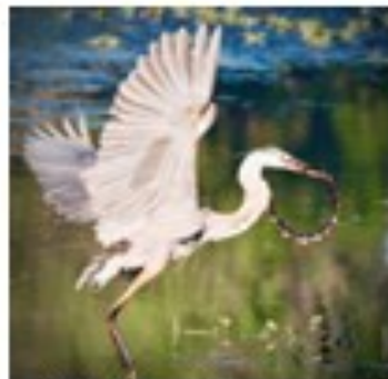
Great Blue Heron with a Broad Banded Water Snake