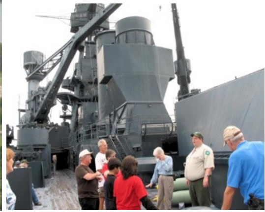
Aboard the Battleship Texas