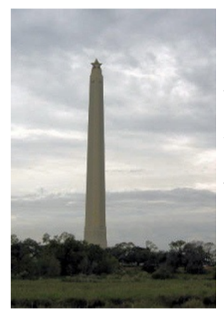
San Jacinto Monument

The above activities need advanced preparation, so if you can help with prep but not be at the event, that's okay. If you cannot help with prep but can assist in the event, sign up on the Special Events Calendar (see link below). If you can do both, contact the coordinator and then sign up. http://www.brazosbend.org/calendar/christmas1.htm