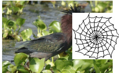
. . . After he got mad