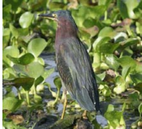
Before he got mad. . .

I finally get to see the green on this Little Green Heron! This guy evidently got mad at me for taking pictures of him, because he puffed up the feathers on his head and walked away!