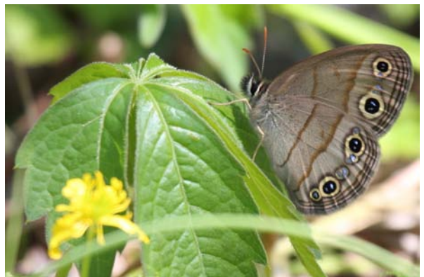
Little wood satyr, Sandy Jespersen, 2009