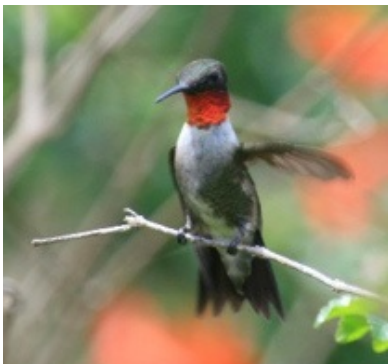
Ruby-throated Hummingbird

http://www.youtube.com/watch?v=W0PTSgysvQU