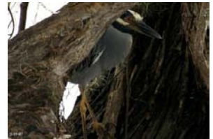
Yellow-crowned Night Heron B. Leach