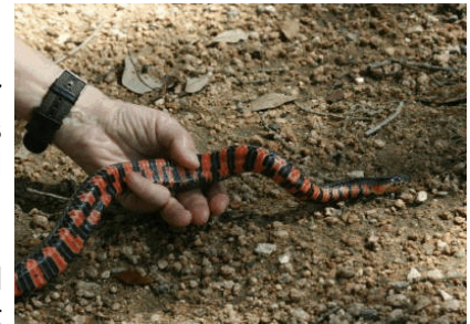
Western Mud Snake