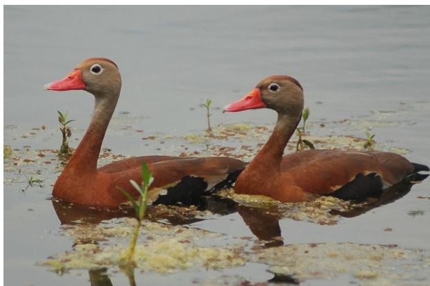
Black-bellied Whistling Ducks at BBSP Randall Hobbet

For Bobwhite, the rains are "untimely," he says. This ground-nesting bird, already in serious trouble statewide due to habitat loss and infestations of fire ants, "needs optimum conditions, not too wet and not too dry." Could the rains deeply impact populations? "Locally, yes," he says. "But we hope they'll recover."