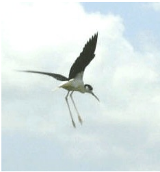
Black-necked Stilt Jerry Zona

Saturday evening hikes to the Observation Tower will be held December 8, 29 and January 19 at 5:00 PM.