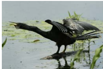
Anhinga